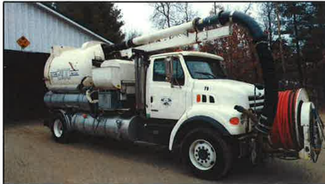
At Left: City officials recently purchased a Vactor Truck from the City of Fremont that will be used for sewer cleaning and vacuum excavation on water leaks.

Payment must be made prior to delivery at the City Office front desk, and delivery will be arranged at that time. Sorry, there are no weekend deliveries.